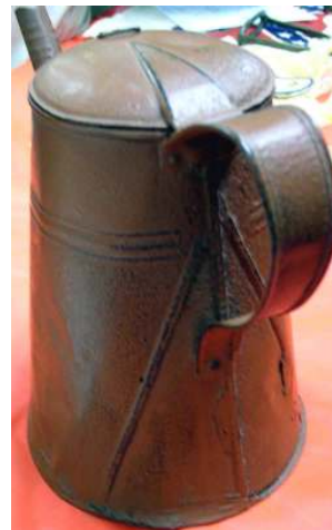
David Garnett's period coffee pot.

David Garnett brought in another of his flea market/antique shop finds: A period coffee pot. Note the A-shaped section under the handle typical of coffee pots of the era.