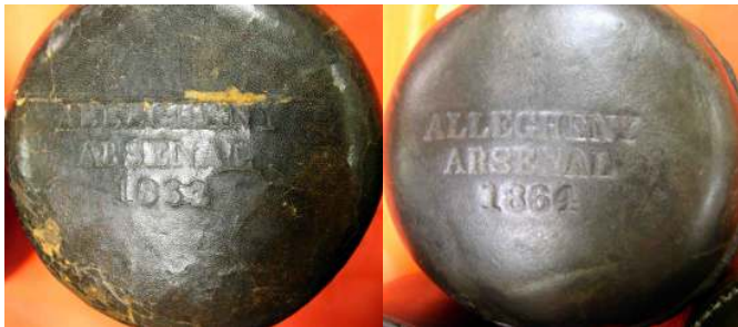
Steve Schmit's 1863 and 1864 pole pads.

This Month's Display Items. Steve Schmit displayed several artillery pole pads that were used to protect the horses from the hard ends of the poles. The pads Steve brought showed the evolution of the pads during the course of the war.