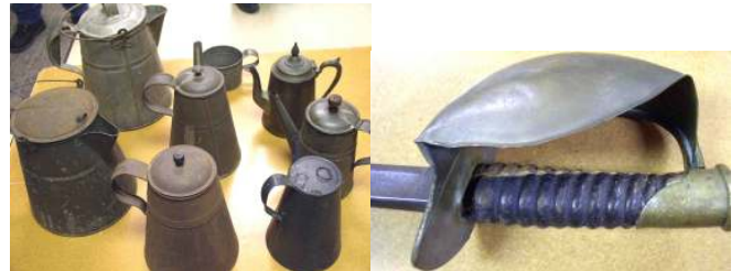
Lloyd Goddard's coffee pot collection (top) and 1855 foot officer's sword with naval cutlass guard (bottom).

Lloyd Goddard showed a collection of coffee pots and an 1855 foot officers sword with a naval cutlass guard.