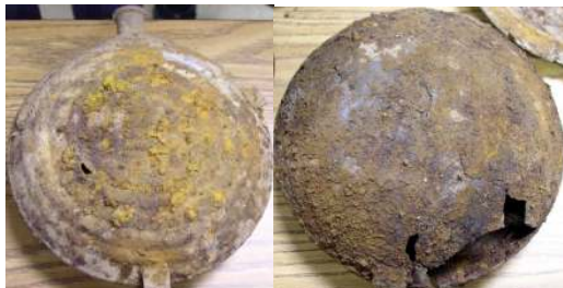
Canteens recovered from a fire pit by Wesley Lubiartz.

Wesley Lubiartz recovered a number of items found in a fire pit. His display included a St. Christopher's medal, a kepi buckle, two canteens, a mess plate, a cartridge tin, a ration can with wire handle, a gun tool, two sword drags, a large CT button, and two large Vermont buttons.