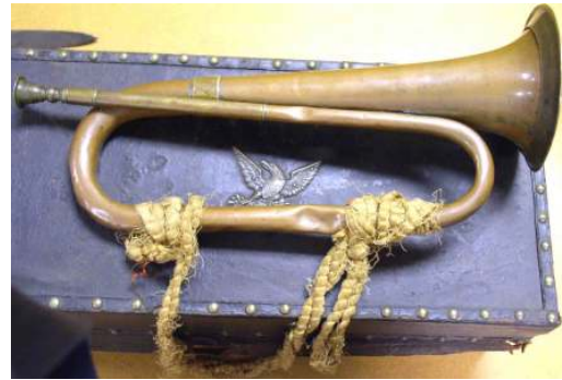
Ben Greenbaum's bugle & case with 1840's shaiko eagle.

This Month's Display Items. Ben Greenbaum displayed an 1842 pistol cartridge box with the small US plate, and a bugle and case with an 1840s shaiko eagle attached.