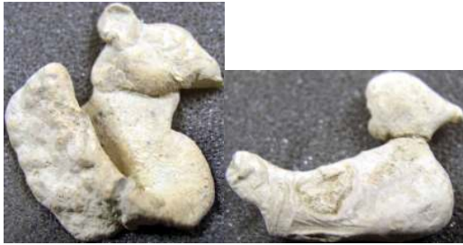
Greg Heath's lead squirrel and duck.

Greg Heath's finds included an Eagle button, several flat buttons, various bullets, a finial, a friction primer, two scabbard tips, and a lead squirrel and duck.