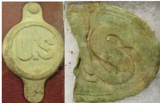
Rick Xedos' U.S. rosette and half of US plate.

Rick Xedos showed numerous finds, such as a Lined I flattened into a poker chip, percussion caps, minies, a Room 1874 hotel tag, half of a US plate, a wire brush cleaner, and, from a 1600s house site, pipe stems and bowls, a trident pewter spoon handle, an arrowhead, some flat buttons, a 1733 cut reale, a bit boss, and epaulette pieces.