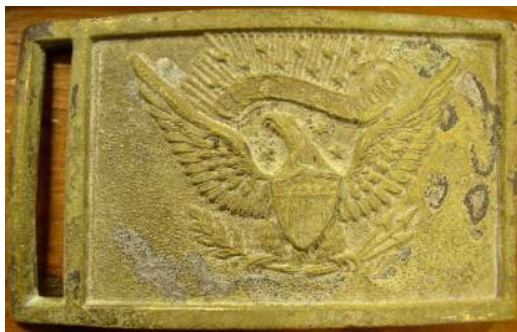
Plate found by one of Ben Greenbaum's students in a garden spot. Another "A" student!