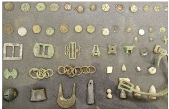
Greg Heath's display included a scabbard drag and a Model 1859 Cavalry spur.