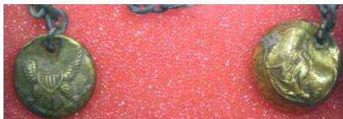
Part of necklace made with period buttons.