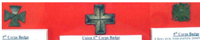
A few of Marshal Cain's corps badges.

Marshall Cain exhibited a nice display of corps badges.