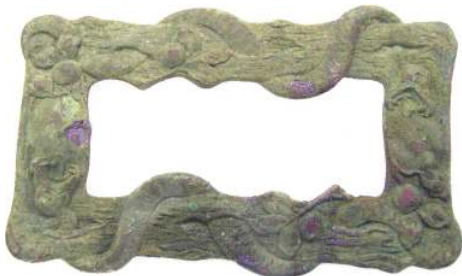
Doug Harris' Colonial buckle with snake.

Doug Harris showed some items that he had dug over the past few months, including a Revolutionary War era frame buckle with snake motif, an NC two-piece, a heart-shaped martingale, a flattened C button (used as a poker chip?), and an artillery fuse. (To those wanting maximum clarity of their relics in the newsletter, please note how nicely Doug's buckle displays on a white background!)