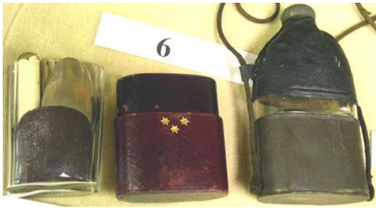
Some of Ben Greenbaum's flasks.

Ben Greenbaum brought several items, including cups, eating utensils, bottles, a coffee/nutmeg grinder, a mucket, flasks, and a coffee pot.