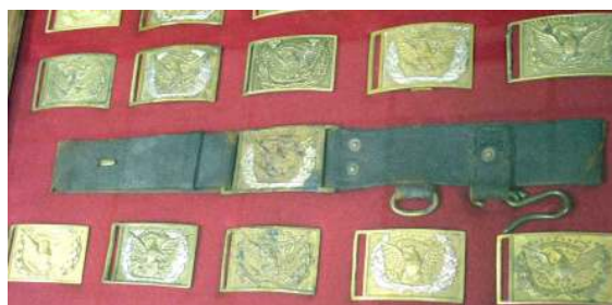
Part of the Allen Lane sword belt plate collection.

Allen Lane exhibited a case of Model 1851 sword belt plates with 21 buckles and 20 different styles.