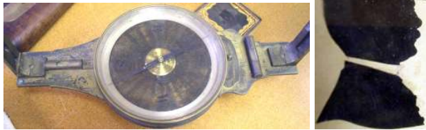
Some of Schuyler Ritter's artifacts.

Marshall Cain exhibited a nice display of corps badges.