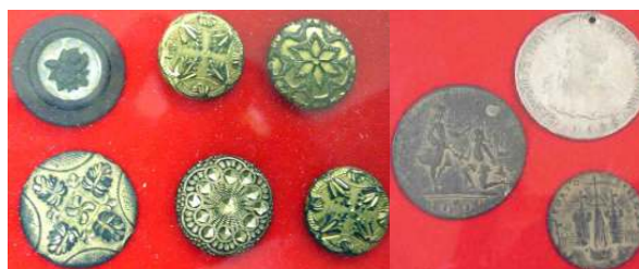
Joe Mooney's flower buttons and Colonial tokens.

Joe Mooney exhibited several cases of items, including numerous Colonial items, such as tokens and flat buttons, and some very nice flower buttons.