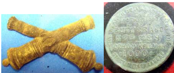
Crossed cannon and Butter-and-Egg-Men token.

Thanks also to the many others thoughtful enough to share part of their collection with us!