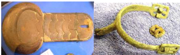
Shoulder scale and Model 1859 spur.